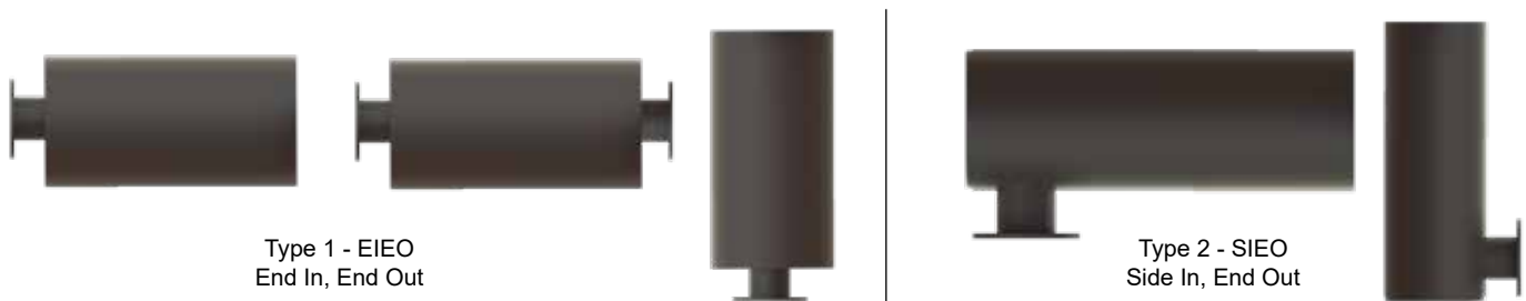
Type 1 - EIEO End In, End Out

Orientation: Orientation and mounting arrangements are viewed horizontally from Left (inlet) to Right (outlet) for nomenclature purpose. Can be mounted vertically, examples below. Custom orientation, multiple inlets and mounting options available.