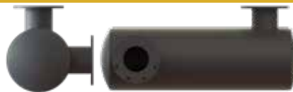
Side In 3 o'clock, Side Out 12 o'clock