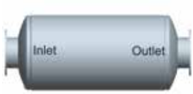
Type 1 - EIEO End In, End Out