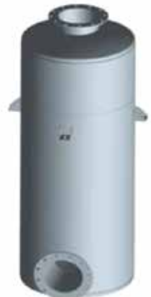
BS Type "B" Bracket Support

Mounting Direction: Silencers may be mounted vertically or horizontally with the drain located accordingly. Specify prior to ordering if silencer is to be mounted vertically.