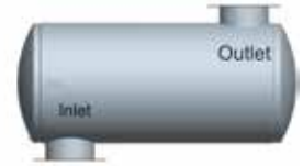
Type 4 - SISO Side In, Side Out