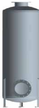
D3 Type "D" Leg Support (3)