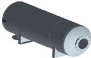
SD Type "F" Saddle Support (2)