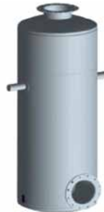
AS Type "A" Trunnion Support