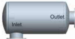
Type 2 - SIEO Side In, End Out