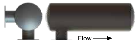
Side In 6 o'clock, Side Out 9 o'clock

Side Inlet and Outlet Placement: Side inlet and outlet placements are viewed from the inlet end. Other placement options are available upon request. Mounting placement positions are noted as clock positions.