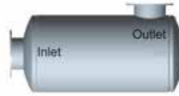
Type 3 - EISO End In, Side Out