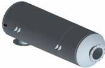
ES Type "E" Bracket Support (4)