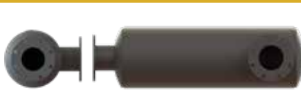
End In, Side Out at 3 o'clock